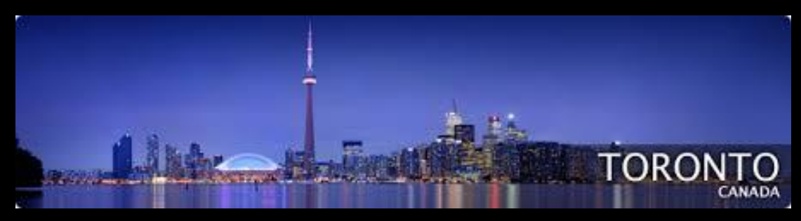
May 01, 2014